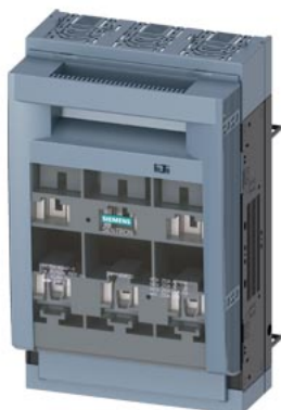
SENTRON, Fuse switch disconnecter 3NP1, 3-pole, NH1, 250 A, for Busbar system 8US 60 mm, Box terminal, Cover level 32/70 mm