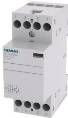
INSTA contactor with 4 NO contacts Contact for 230 V AC, 400V 25A Control 115 V AC