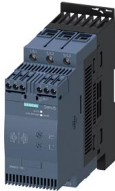
SIRIUS soft starter S2 63 A, 30 kW/400 V, 40 °C 200-480 V AC, 110-230 V AC/DC Screw terminals