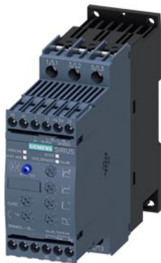
SIRIUS soft starter S0 25 A, 11 kW/400 V, 40 °C 200-480 V AC, 24 V AC/DC Screw terminals