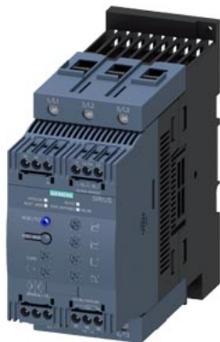
SIRIUS soft starter S3 106 A, 55 kW/400 V, 40 °C 200-480 V AC, 110-230 V AC/DC Screw terminals