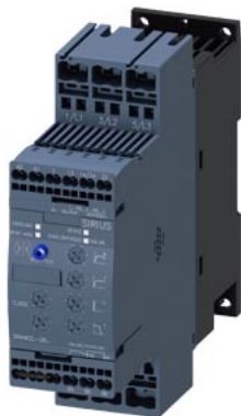
SIRIUS soft starter S0 12.5 A, 5.5 kW/400 V, 40 °C 200-480 V AC, 24 V AC/DC spring-type terminals