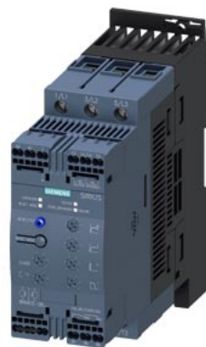
SIRIUS soft starter S2 63 A, 37 kW/500 V, 40 °C 400-600 V AC, 24 V AC/DC spring-type terminals