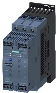
SIRIUS soft starter S2 72 A, 45 kW/500 V, 40 °C 400-600 V AC, 24 V AC/DC Screw terminals