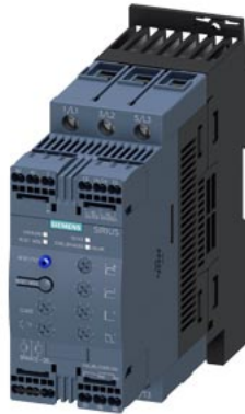
SIRIUS soft starter S2 72 A, 37 kW/400 V, 40 °C 200-480 V AC, 110-230 V AC/DC spring-type terminals