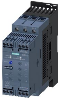
SIRIUS soft starter S2 63 A, 37 kW/500 V, 40 °C 400-600 V AC, 24 V AC/DC Screw terminals Thermistor motor protection