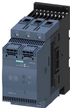
SIRIUS soft starter S3 80 A, 45 kW/400 V, 40 °C 200-480 V AC, 24 V AC/DC spring-type terminals